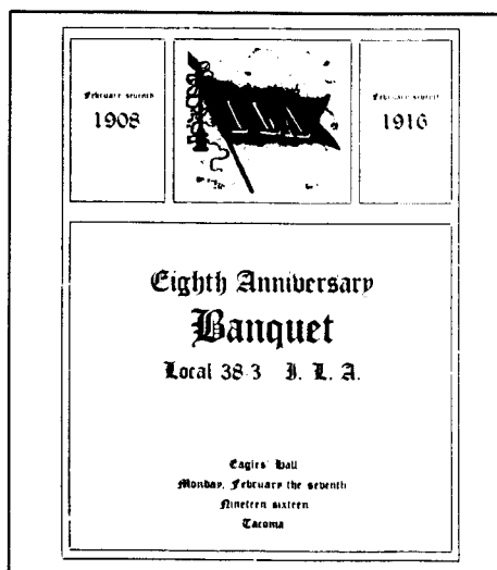
Program of the Eighth Anniversary Banquet of Local 38-3, 1916.